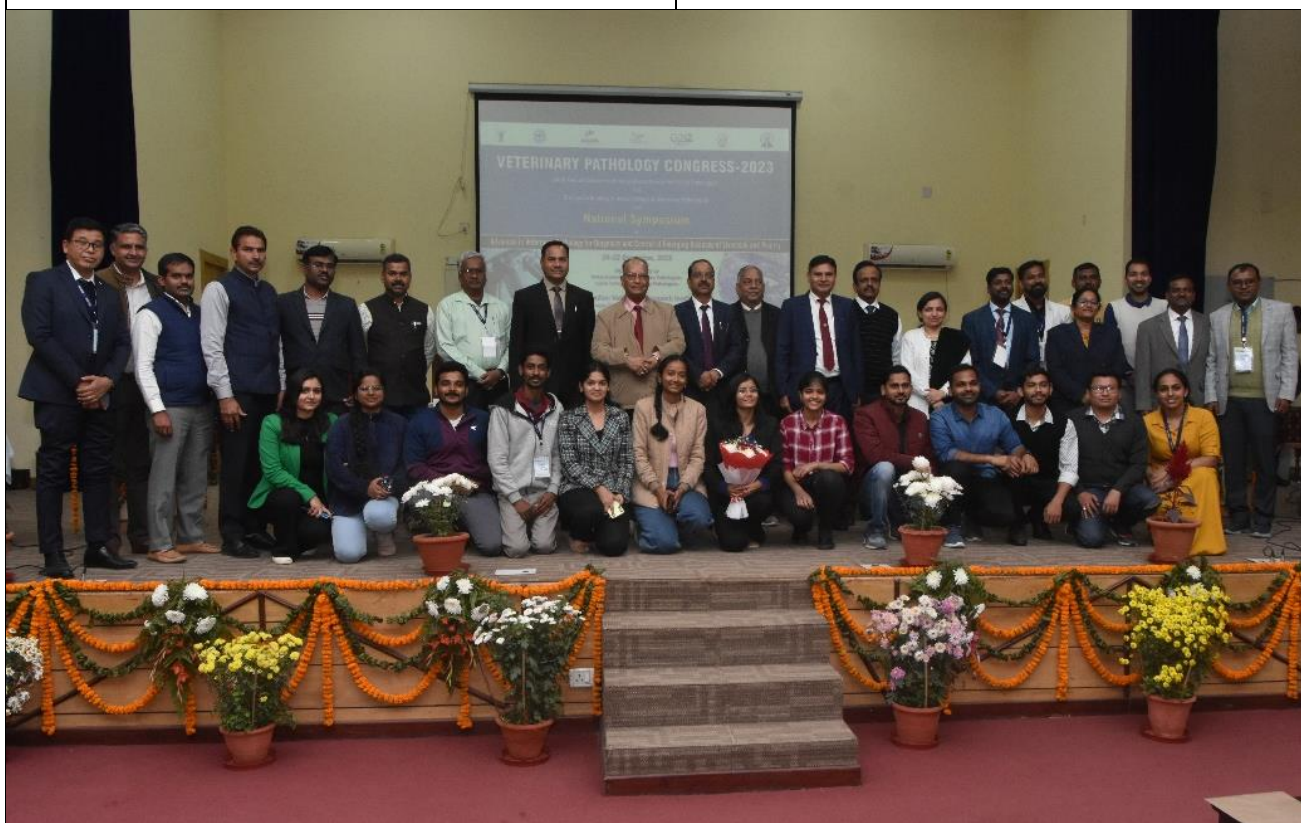
Group photo of Office Bearers, IAVP, ICVP and Organizing Team VPC-2023