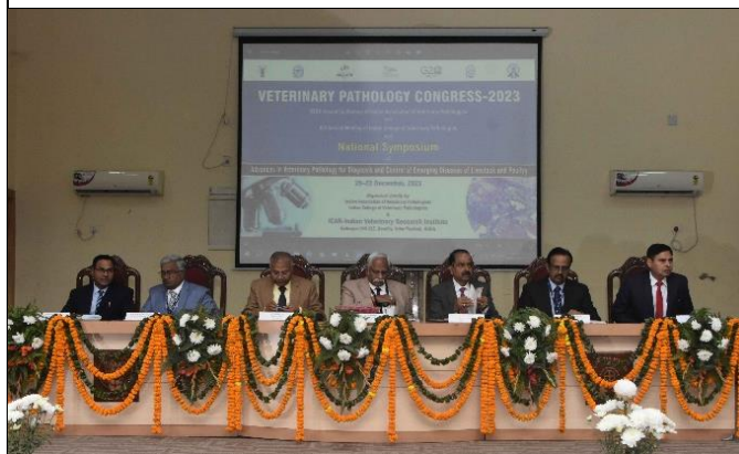
Chief Guest, Director, IVRI and Office bearers of IAVP and ICVP on dais