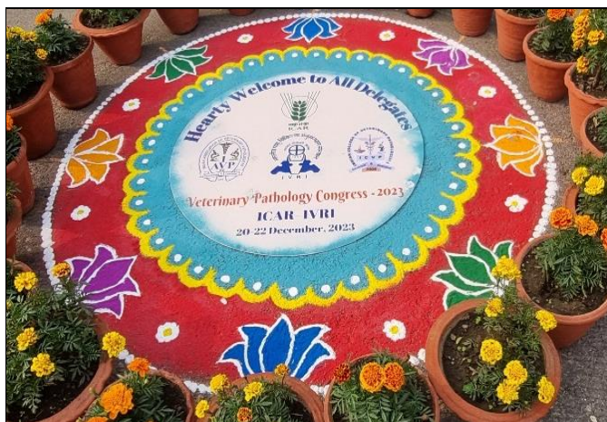
Welcome Veterinary Pathology Congress, 2023 Rangoli at ICAR-IVRI, Izatnagar, UP