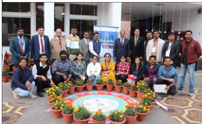
Arrival of dignitaries and delegates in front of Auditorium