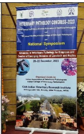
Welcome VPC, 2023 at ICAR-IVRI and VPC, 2023 Print News