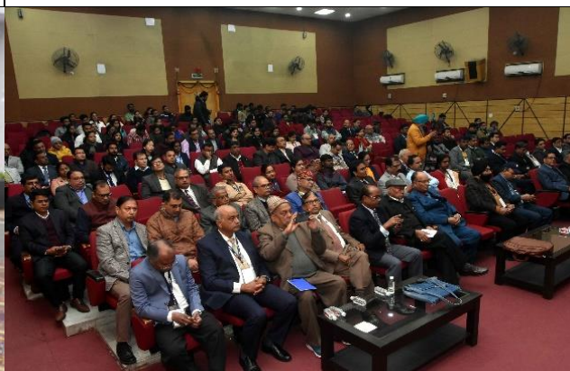
Distinguished invitees and delegates present in inaugural function at Auditorium